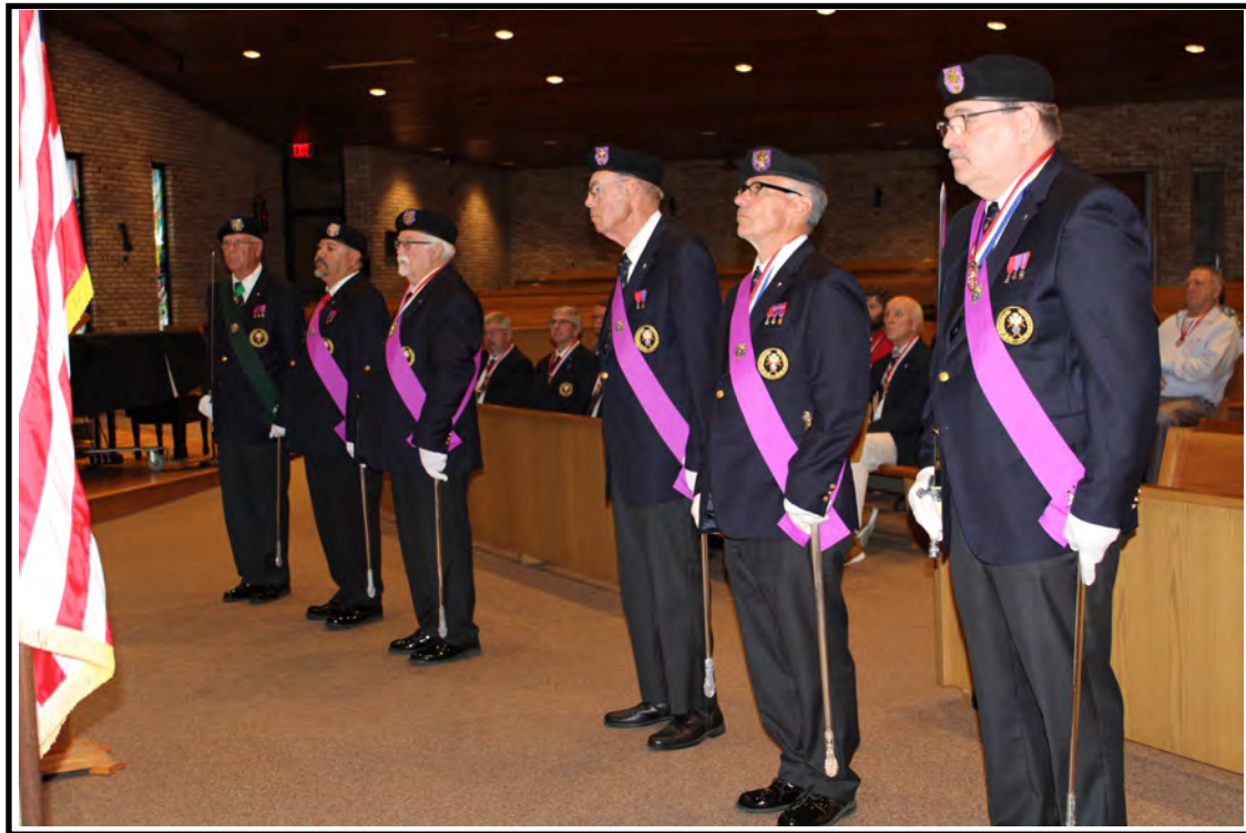
Honor Guard Commanders