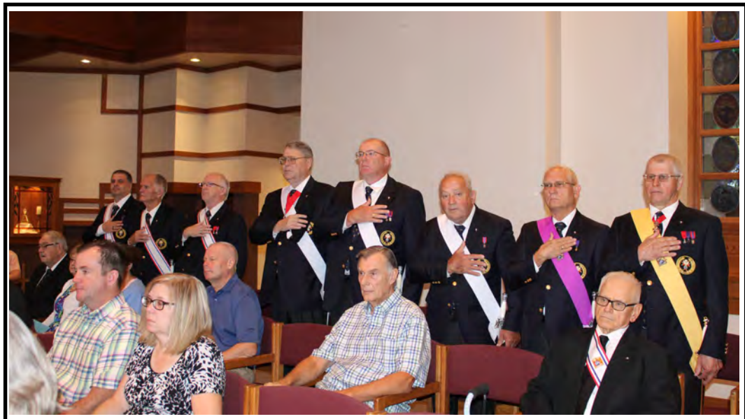
MI District 4 Honor Guard St. Jude Thaddeus Essexville Sunday, August 27, 2023