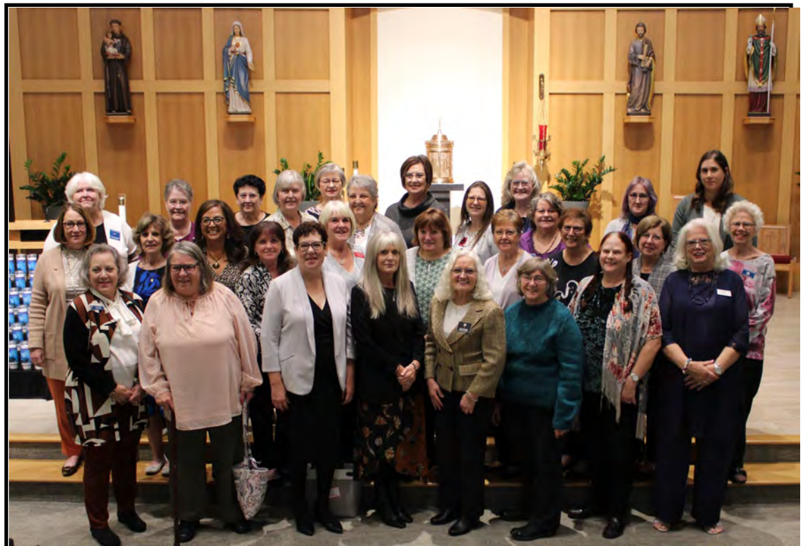
Ladies Class Picture St. Patrick's Grand Haven